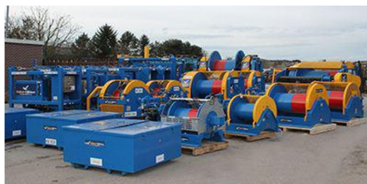
Winches Air & Hydraulic