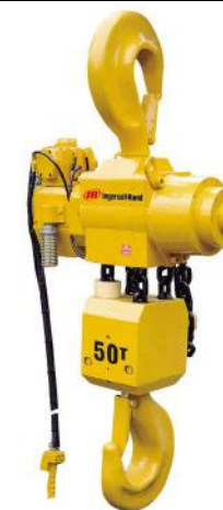
50 t Air Hoist, hook mounted