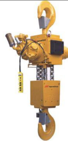
100 t Air Hoist, hook mounted