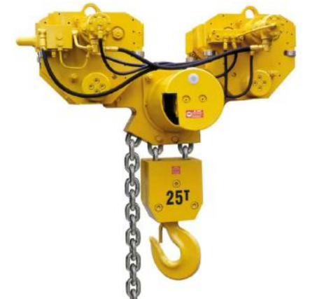
25 t Hydraulic Hoist with motorised trolley